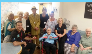
1. Central Hub