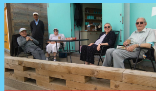
4. Sandy Hub