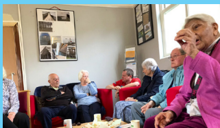
2. Shoebury Hub