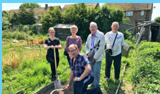
3. Muddy Hub